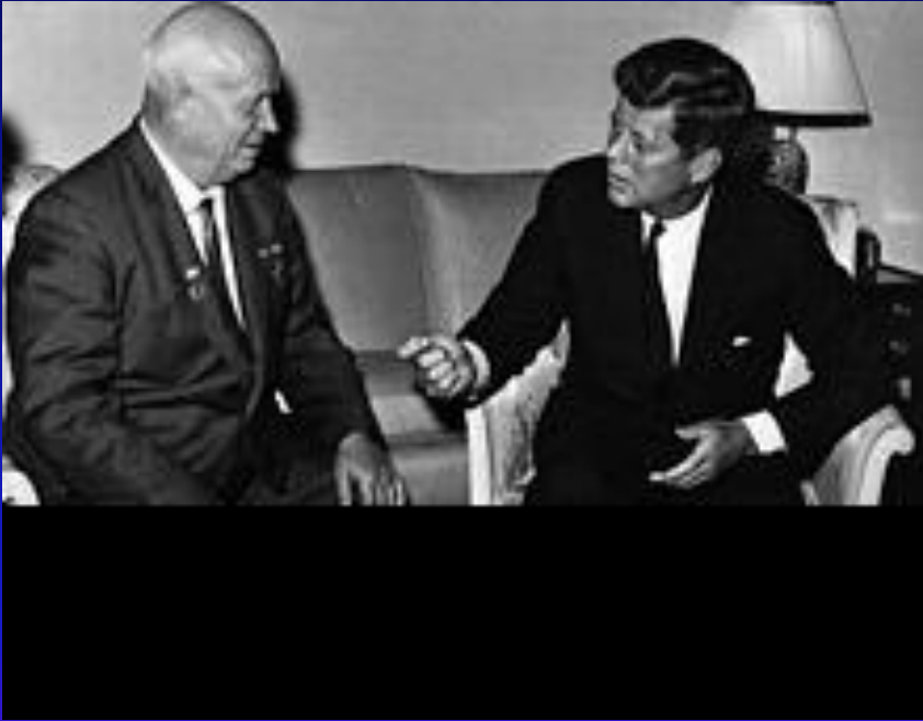
Khrushchev & Kennedy